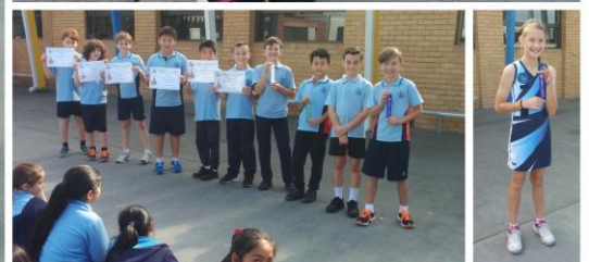
School Cross Country Trial Competitors