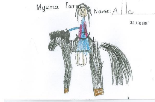
I went on the pony - Aila