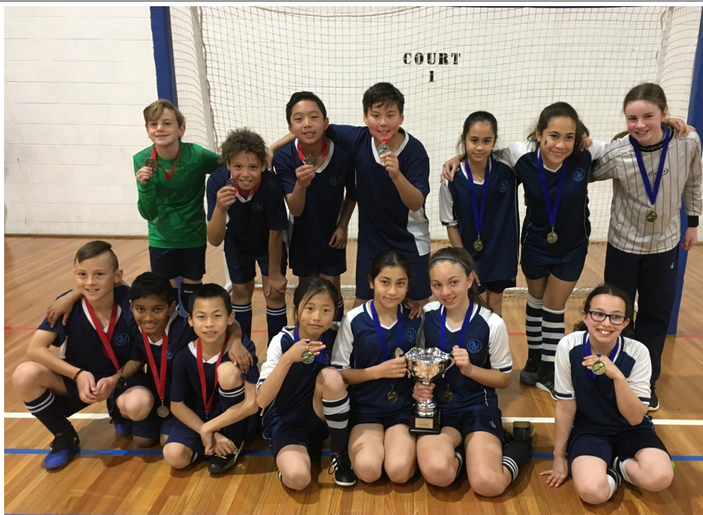
Year 5/6 Indoor Soccer Teams