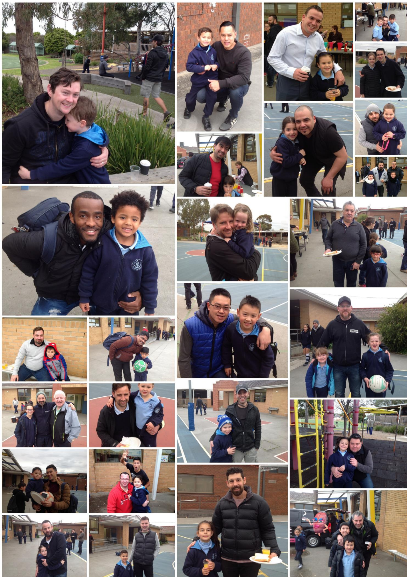
2018 Father's Day Breakfast