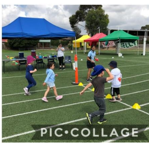
Prep 2019 Sports Carnival