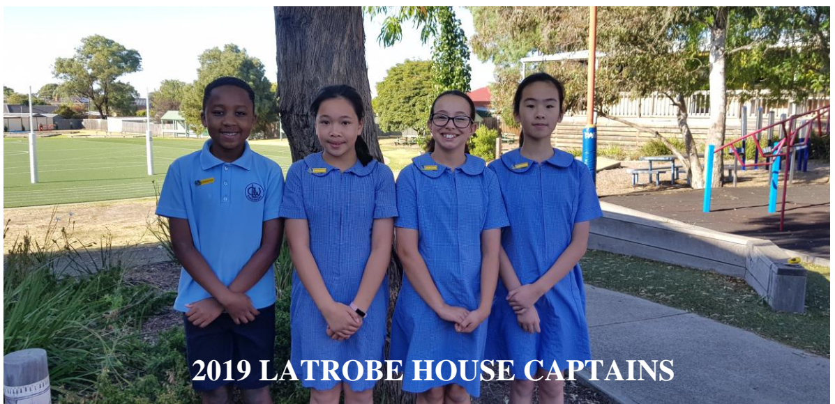
2019 LATROBE HOUSE CAPTAINS