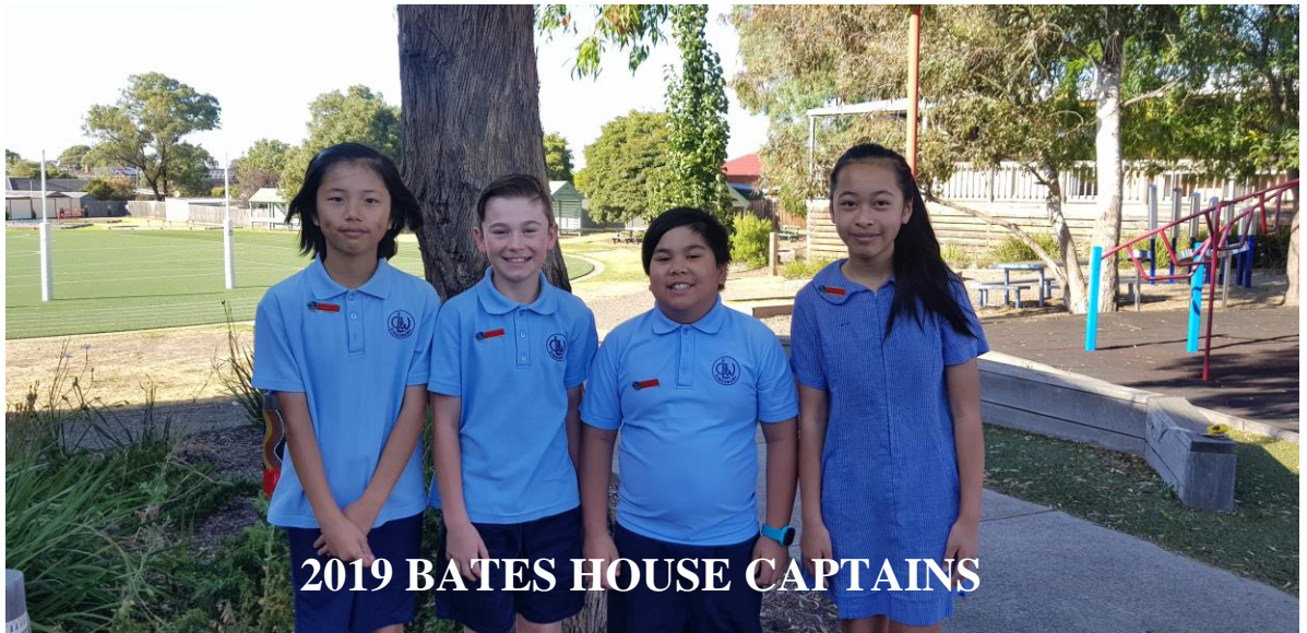
2019 BATES HOUSE CAPTAINS