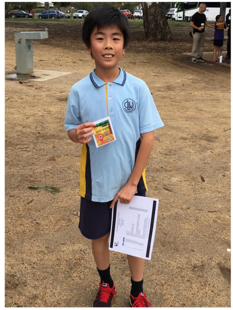
Division Cross Country Runners