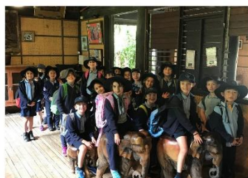
Melbourne Zoo Excursion