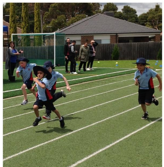
School Sports Carnival