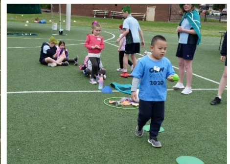
Prep 2020 Sports Carnival