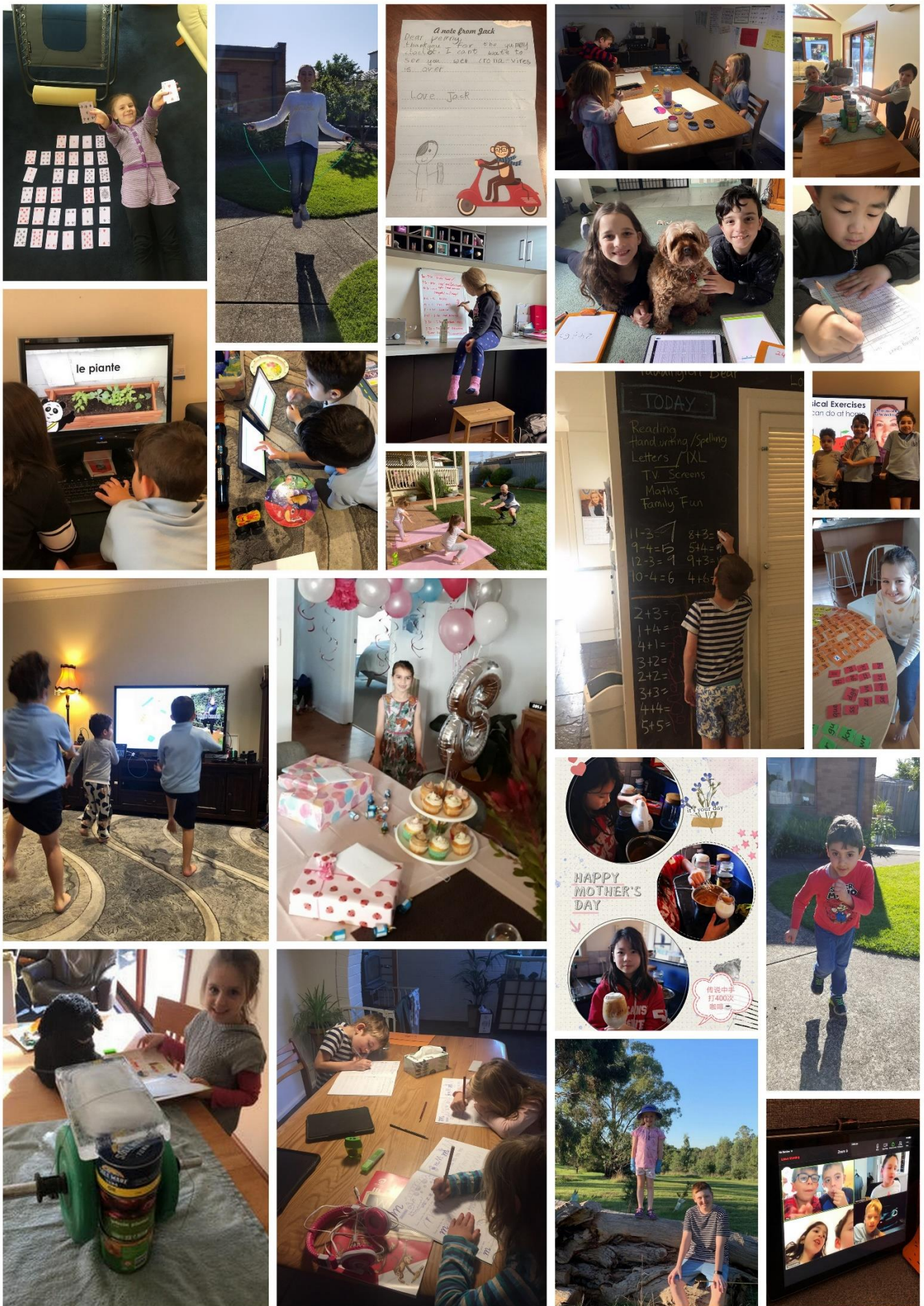
Learning from Home Week 5 Photos