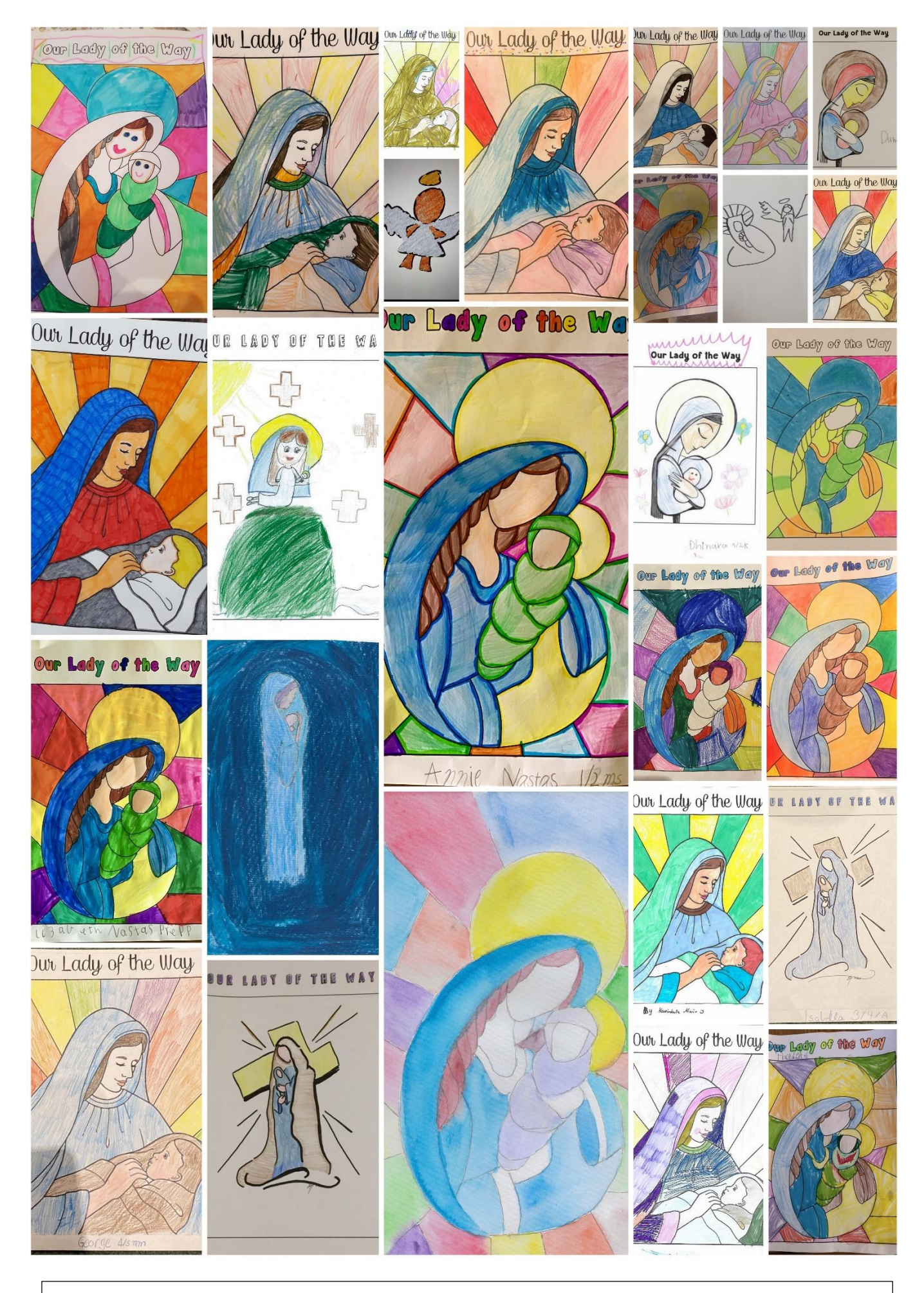
Learning from Home Feast Day Artwork