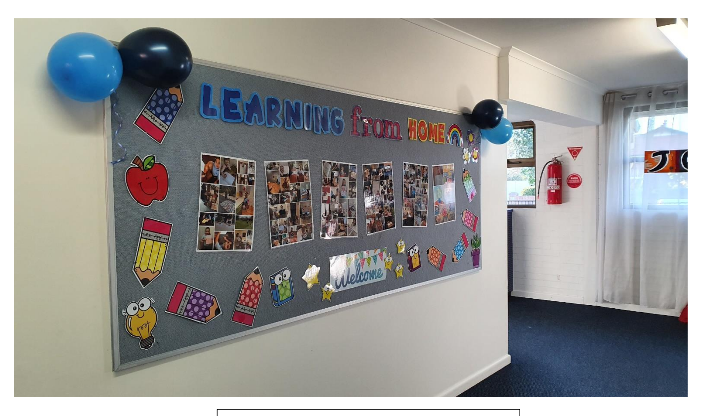
Learning from Home Collage Tribute