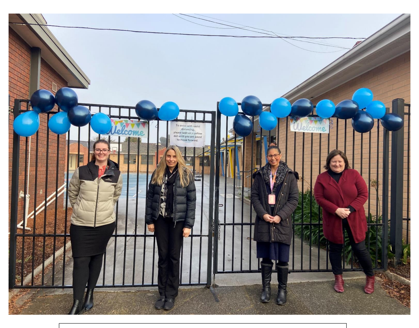
Excited teachers waiting to greet their students this morning!