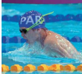
Sports Institute & Academy