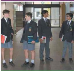
A world of opportunities

Two campuses - Preston and Bundoora. For further details call the registrar 9468 3304 or go to www.parade.vic.edu.au