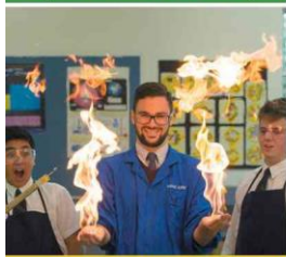
Exciting pathways await