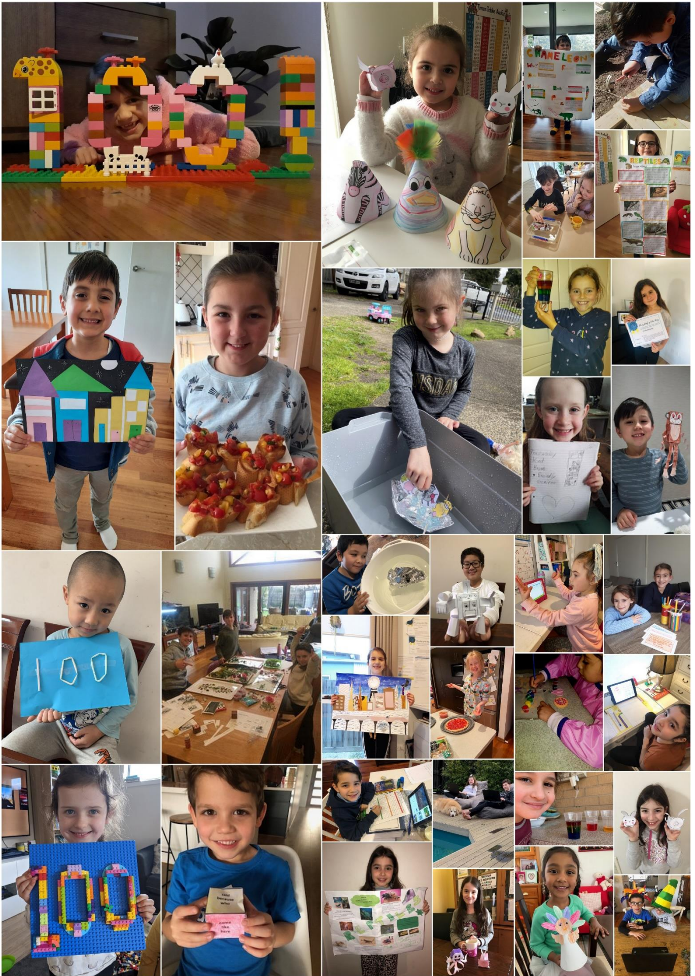
Students at Work & Play in Week 5 * View the video of all pictures in our school app!