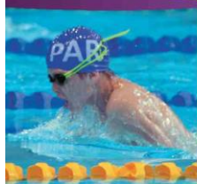
Sports Institute & Academy