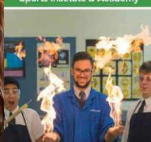
Exciting pathways await