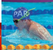
Sports Institute & Academy