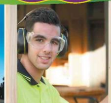
Specialists in boys' education