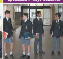
A world of opportunities

Two campuses - Preston and Bundoora. For further details call the registrar 9468 3304 or go to www.parade.vic.edu.au