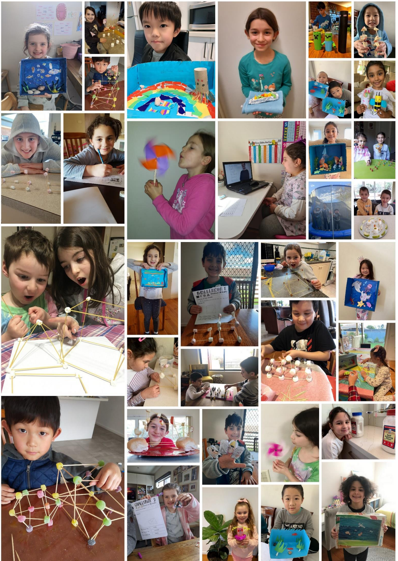
Students at Work & Play in Week 7 * View the video of all pictures in our school app!