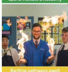
Exciting pathways await