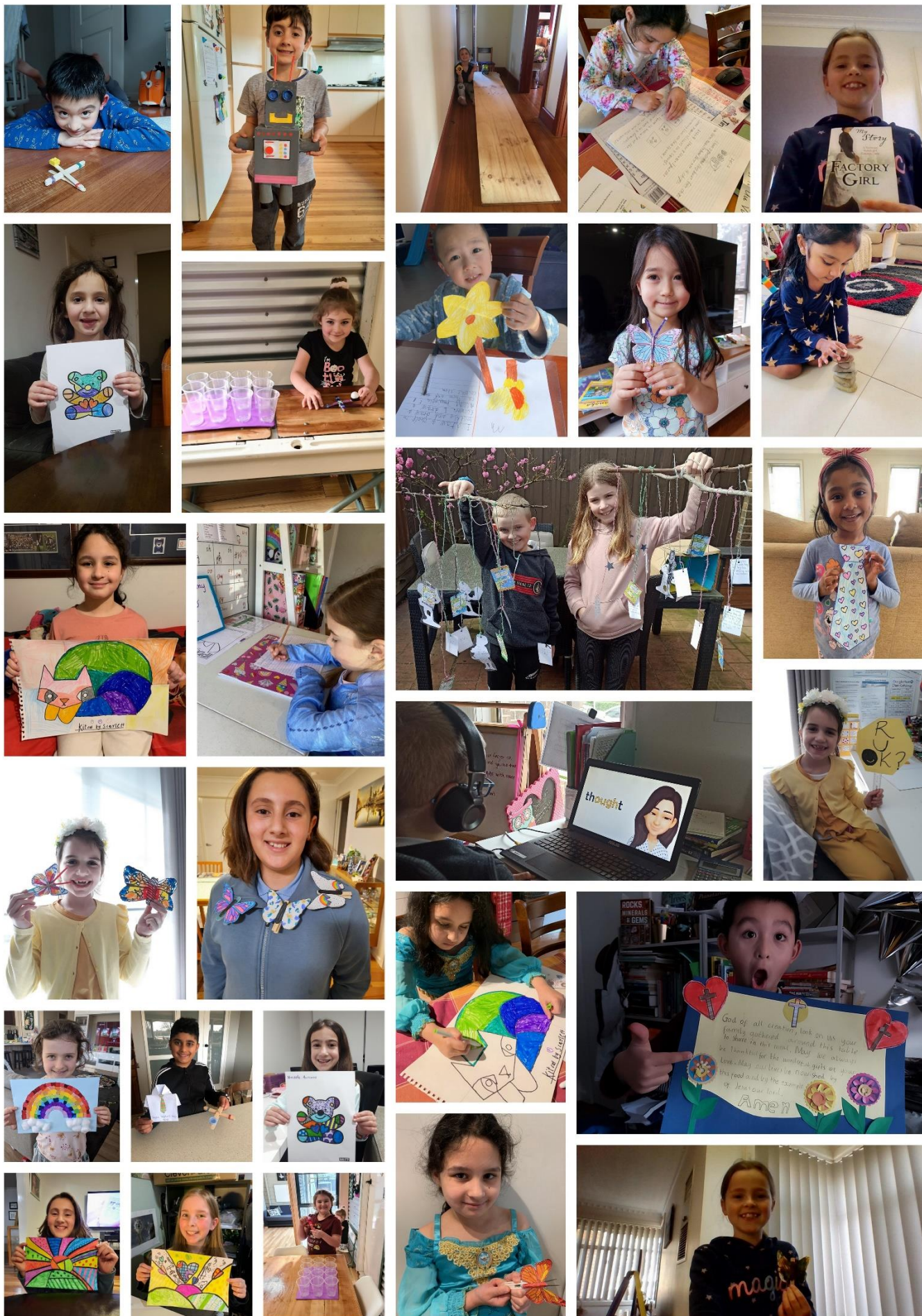
Students at Work & Play in Week 9 * View the video of all pictures in our school app!