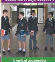
A world of opportunities

Two campuses - Preston and Bundoora. For further details call the registrar 9468 3304 or go to www.parade.vic.edu.au