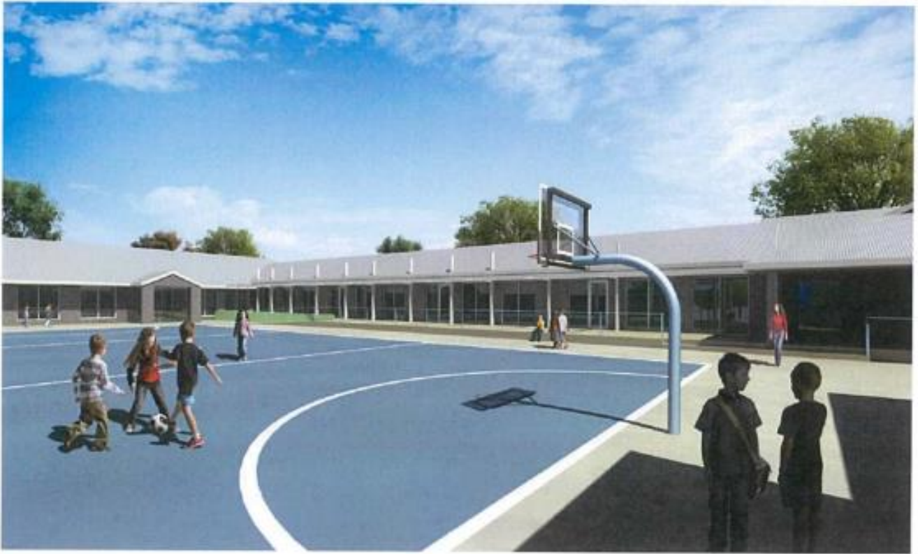
Sample view of deck and new entrances to Classrooms 1 - 4