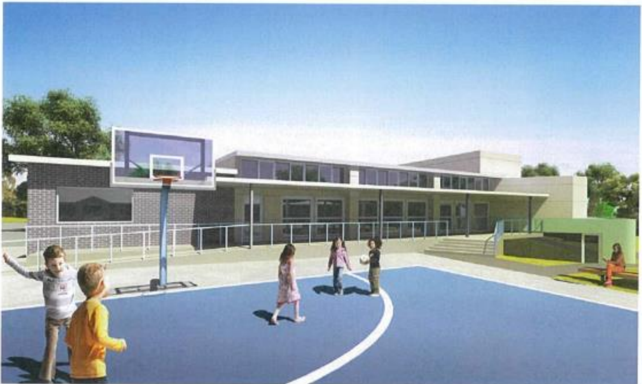
Sample view of deck and new entrance to the Hall