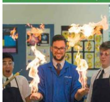
Exciting pathways await