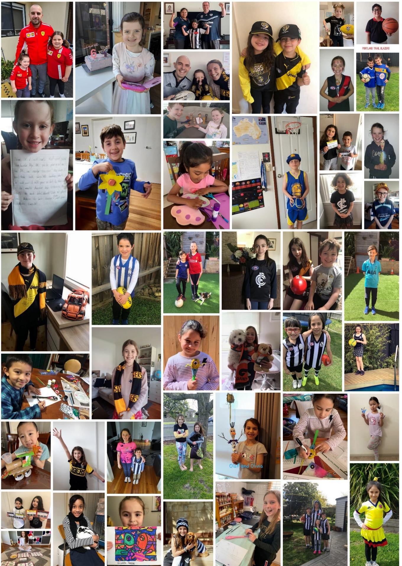
Students at Work & Play in Week 10