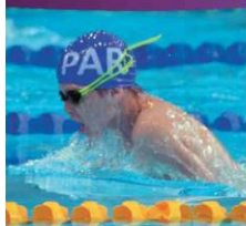
Sports Institute & Academy