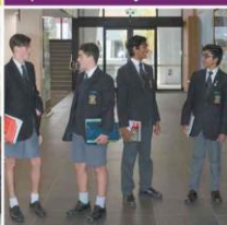
A world of opportunities

Two campuses - Preston and Bundoora. For further details call the registrar 9468 3304 or go to www.parade.vic.edu.au