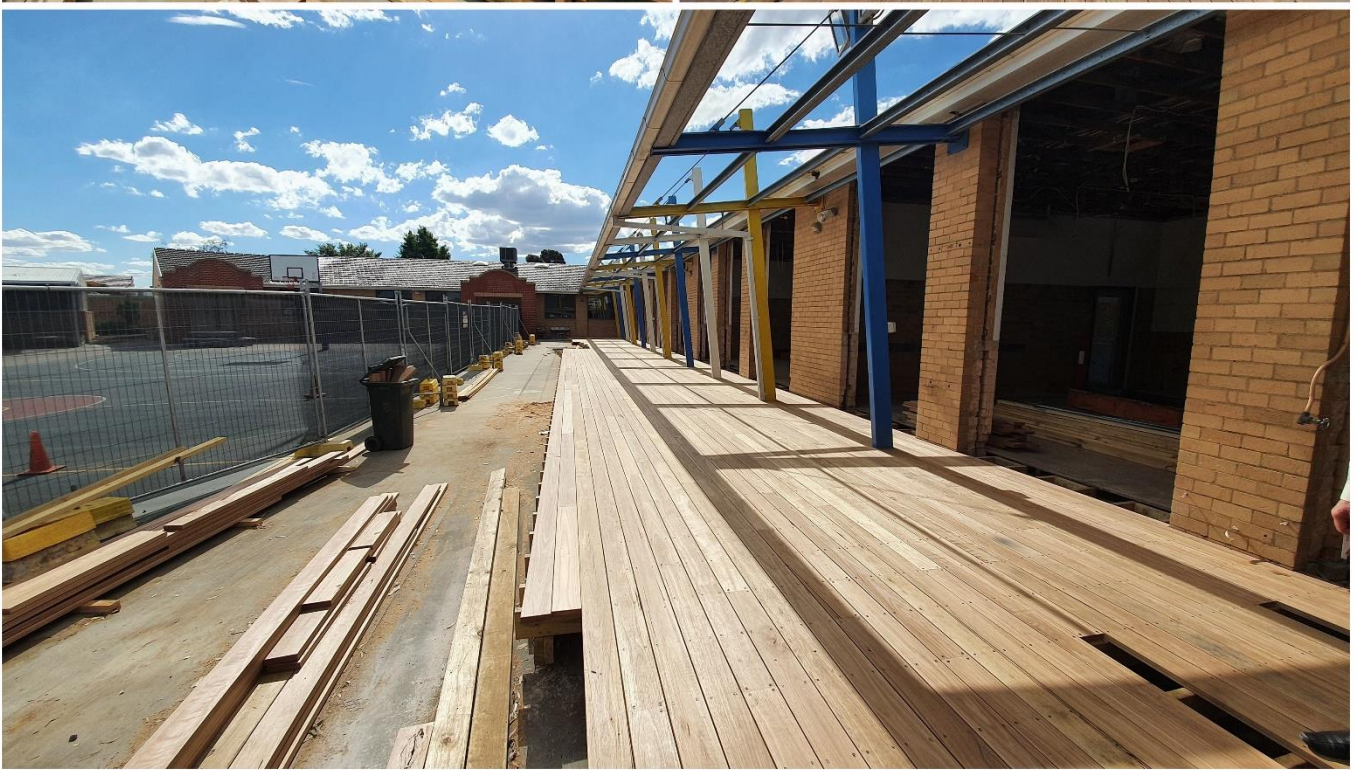
Classroom Deck Area & Door Openings