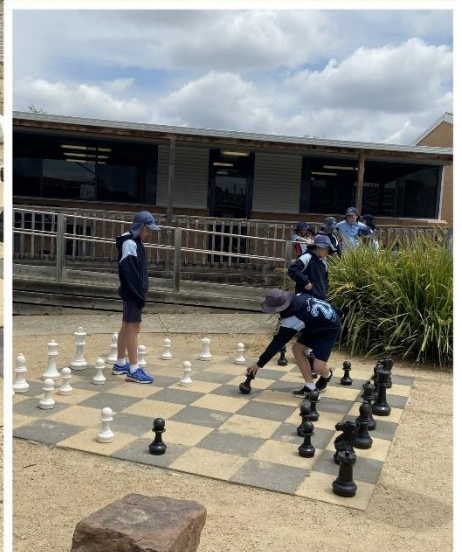
Year 6 Chess Challenge