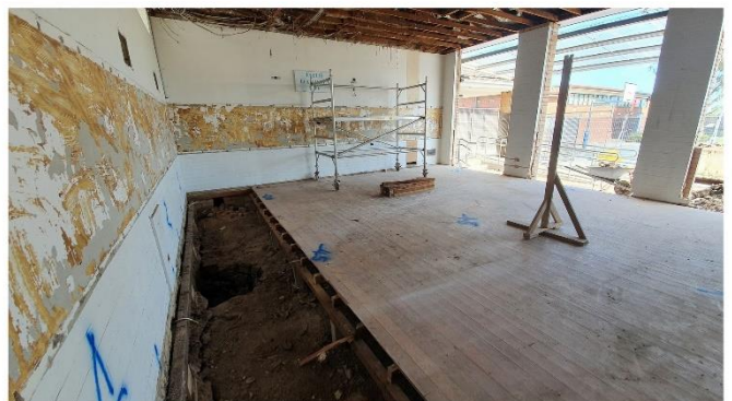
Refurbishment Works Week 2