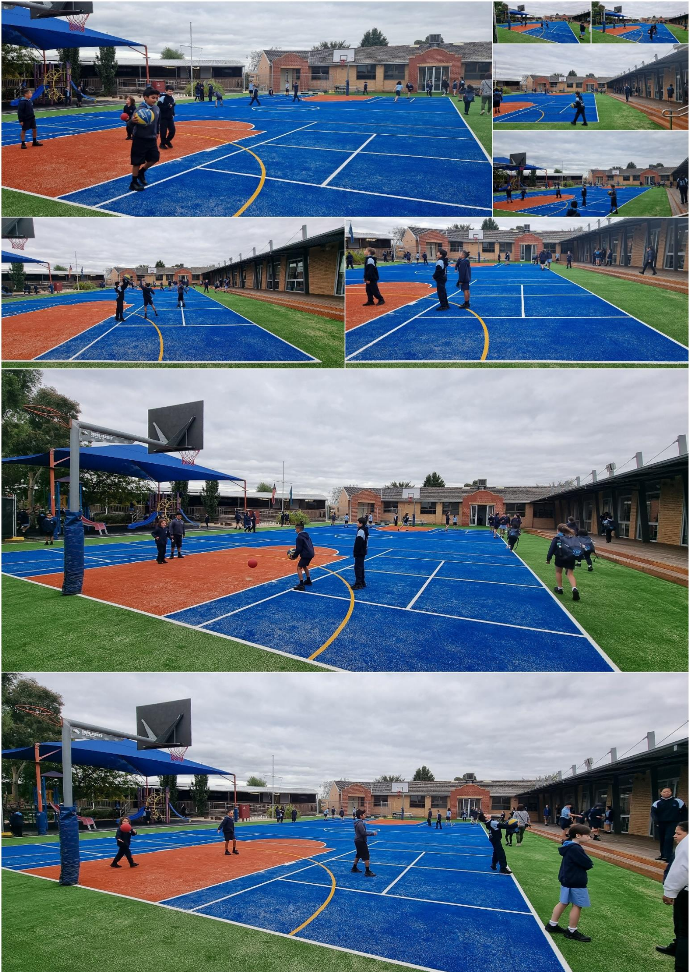
New Basketball Court Play Space