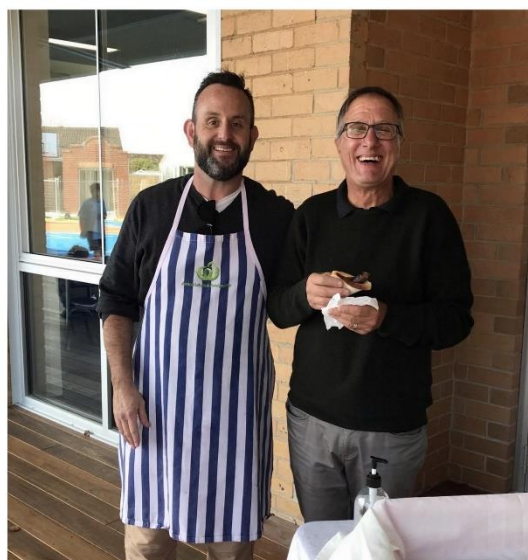
Feast Day Sausage Sizzle