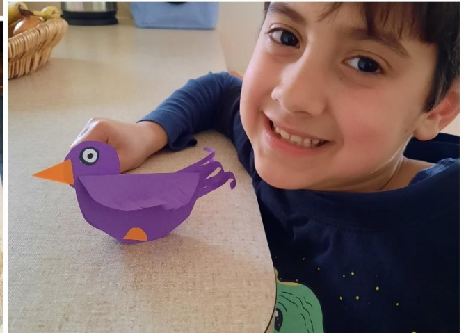
Week 6 Photos