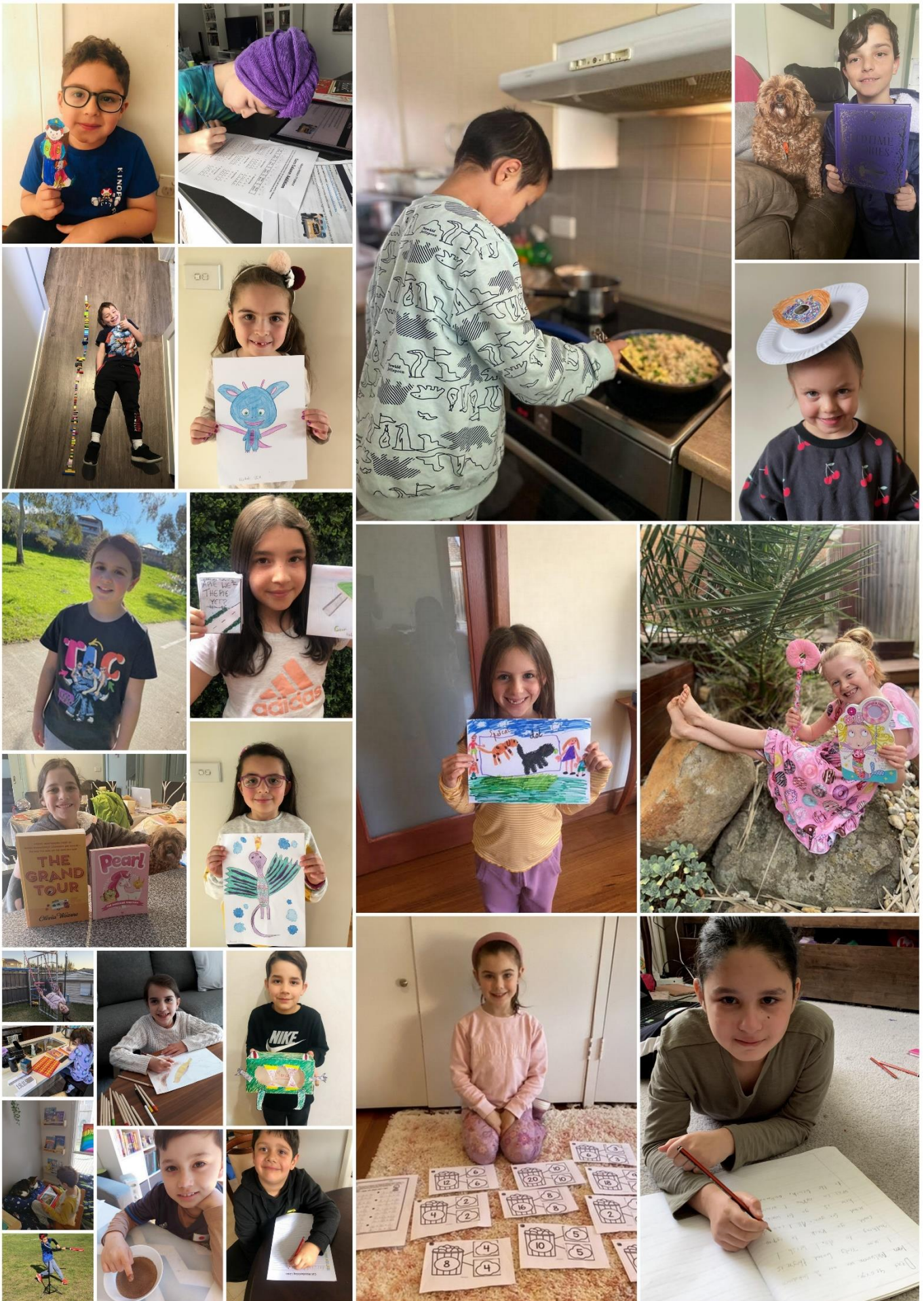
Week 7 – Students @ Work & Play