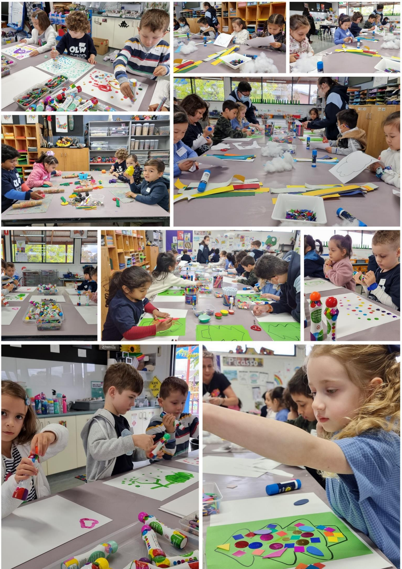
Prep 2022 Art Orientation Session