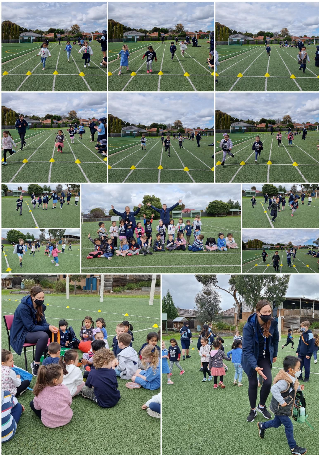
Prep 2022 Phys. Ed Orientation Session