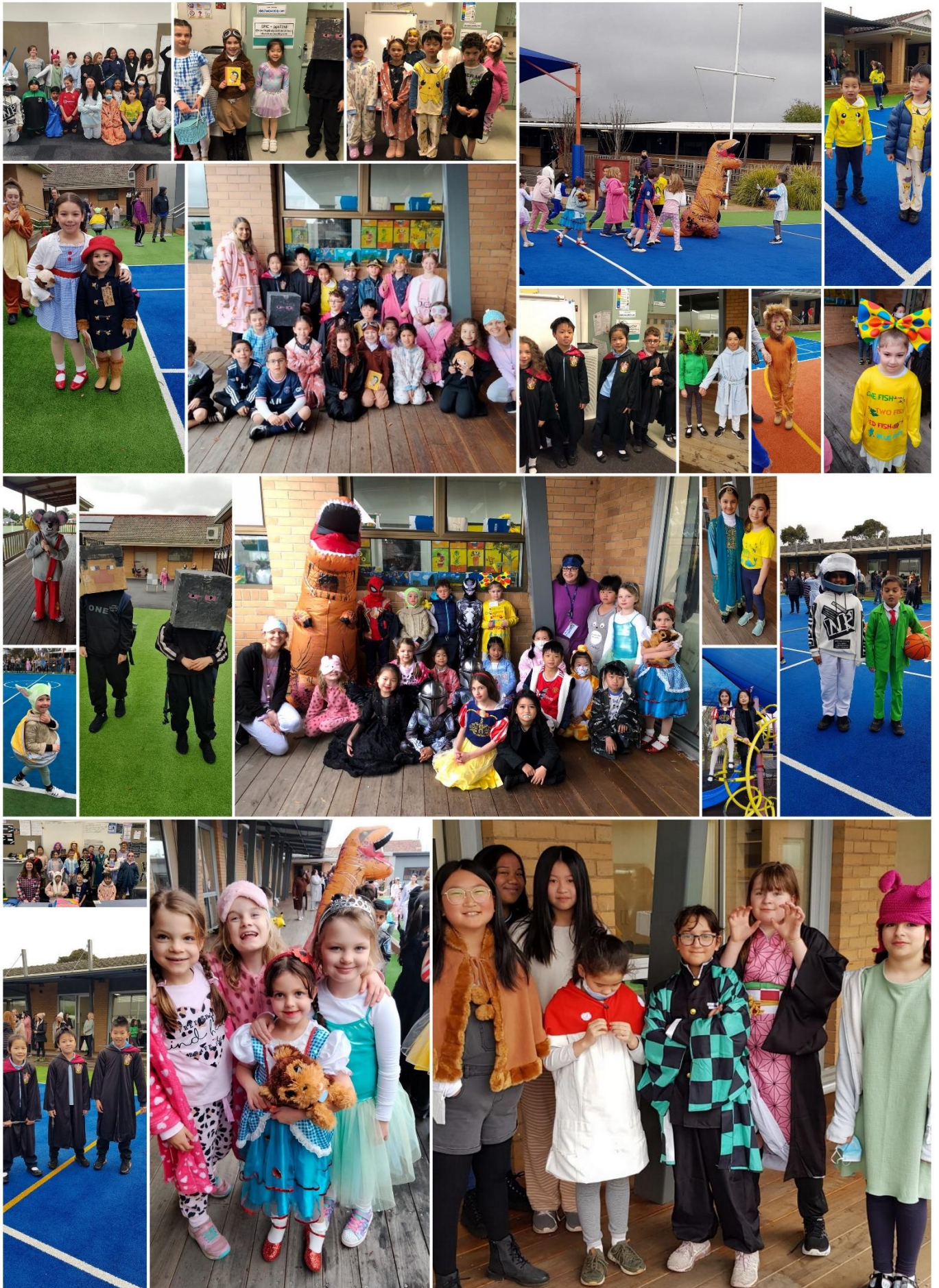
Book Week Dress Up Day