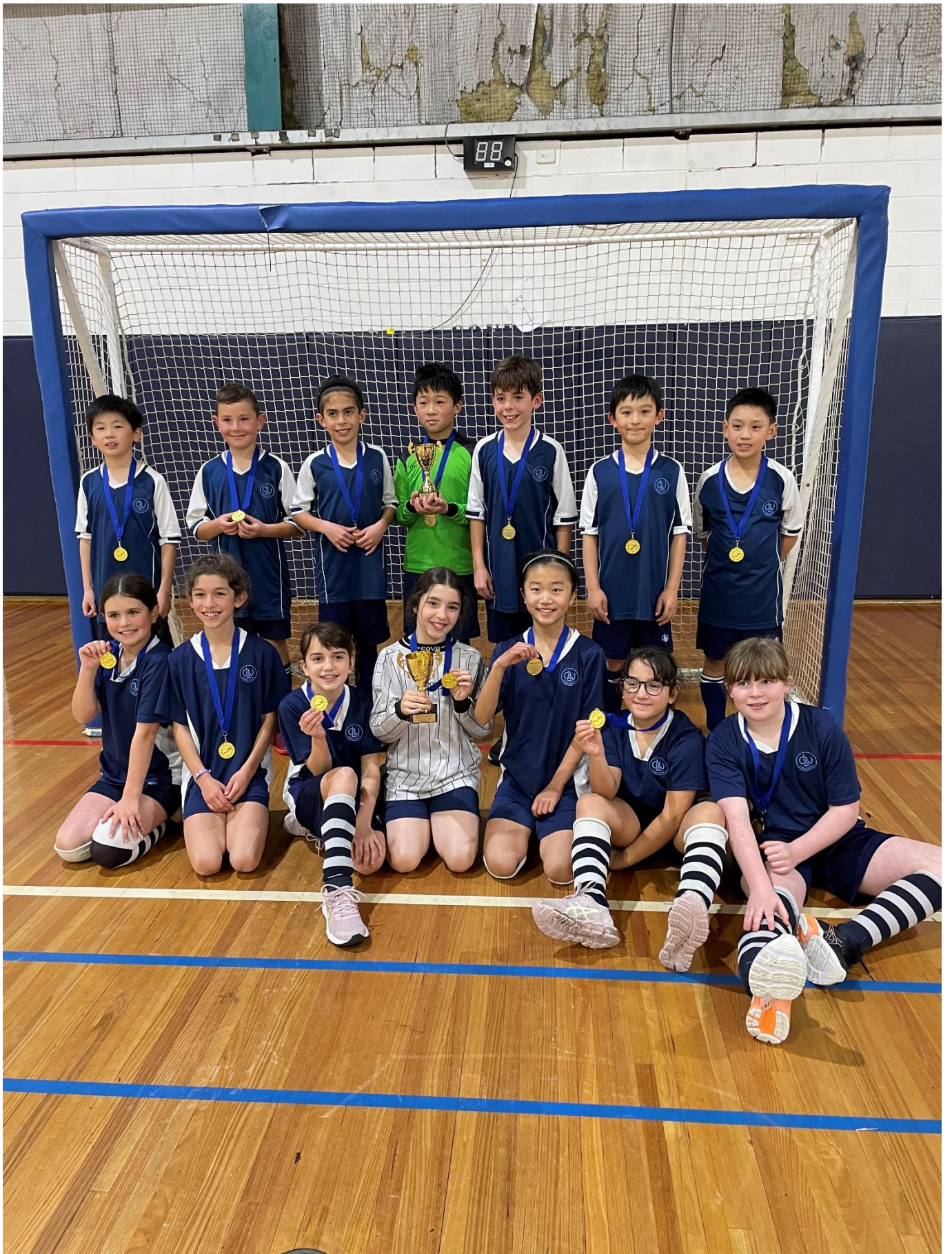
Year 3/4 Indoor Soccer Champions!