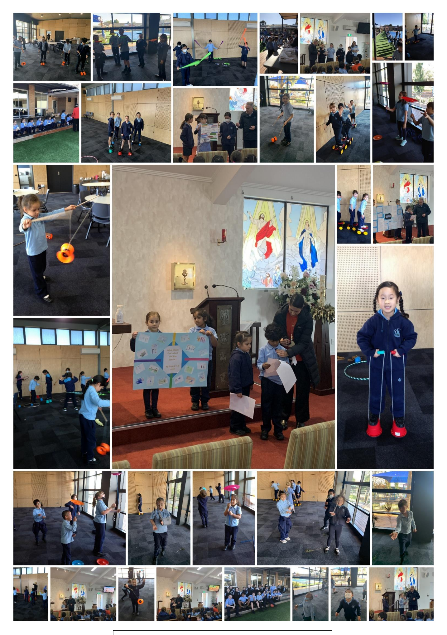
Feast Day 2022 Celebrations