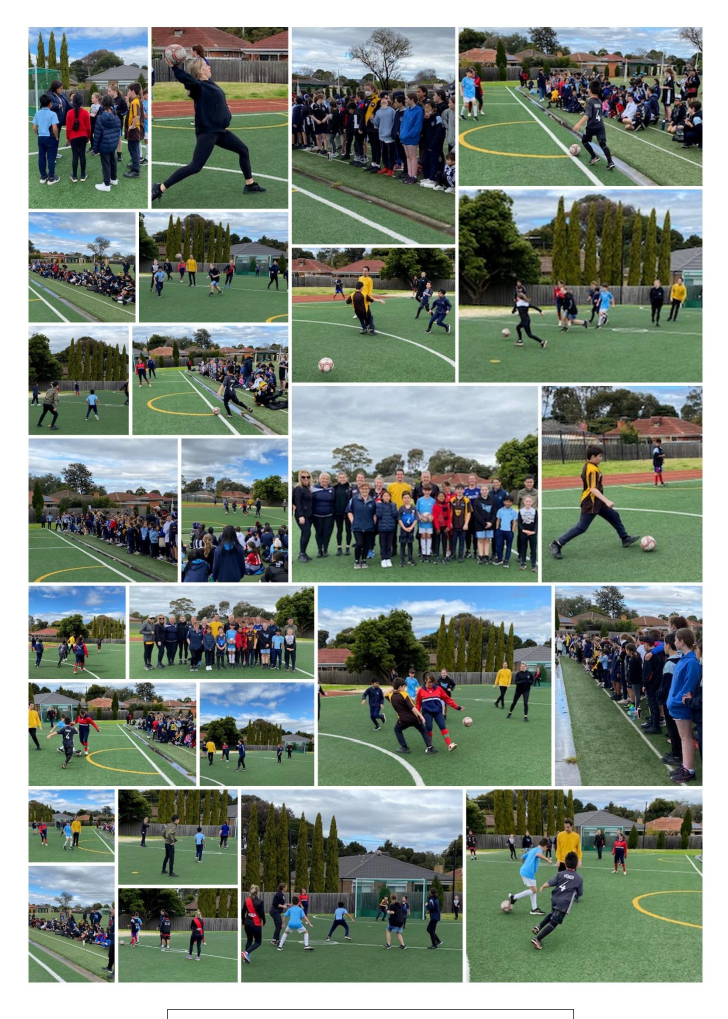
SRC v Staff Team Colours Day Match