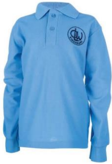
Polo Top Long Sleeve