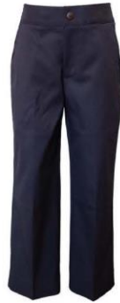
Navy Double Knee Trouser