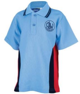
Bates House Polo - Red