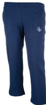
Trackpants with emb crest