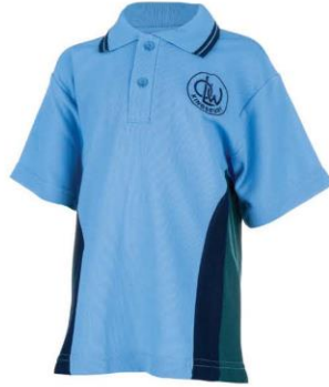
Kelly House Polo - Green