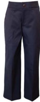
Navy Double Knee Trouser