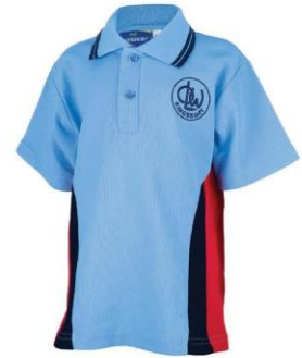
Bates House Polo - Red