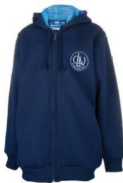
Zipped Hoodie Jacket

For current prices, please refer to www.bobstewart.com.au