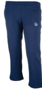
Trackpants with emb crest