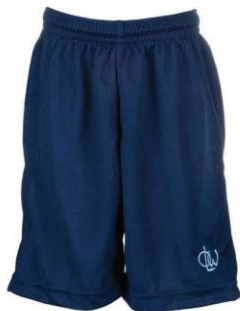
Sport Shorts with crest