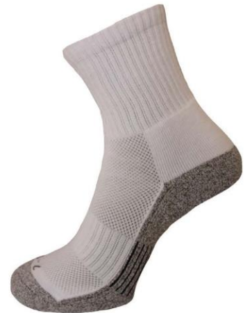
Sports Sock White 2 pkt