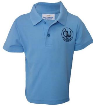
Polo Short Sleeve