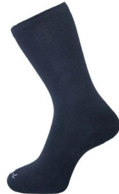
Sock Crew Navy 3 pkt