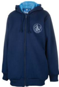
Zipped Hoodie Jacket