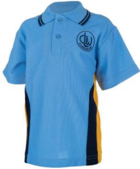
Latrobe House Polo -Yellow