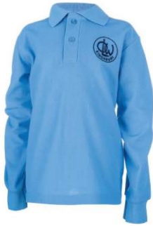
Polo Top Long Sleeve