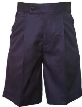
Navy Primary Shorts with Elastic back