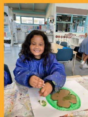
Saint Patrick's painting!