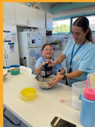
Delicious cooking activities